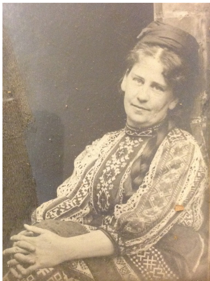
Fig. 1. Eugenie Göring

There are alternate spellings for Göring: Goering, Goring, Gering, Gehring, Goehring. Some are phonetic variations, and some are for protection – relatives trying to dis-